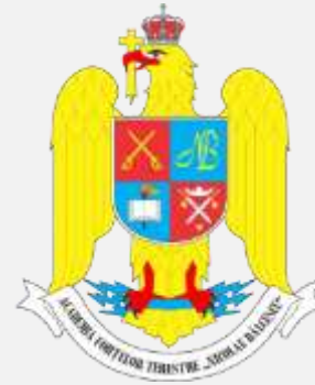
"Nicolae Balcescu" Land Forces Academy