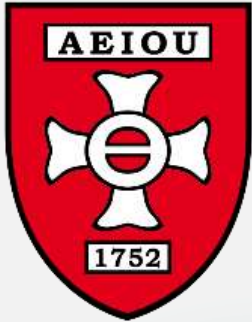
Theresan Military Academy