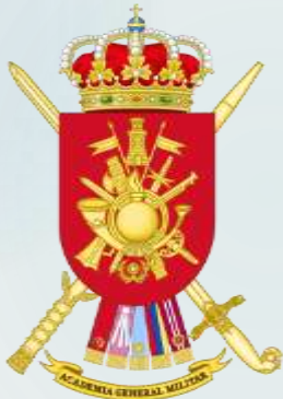
General Military Academy