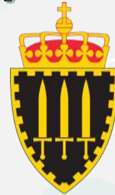
Norwegian Defence University College